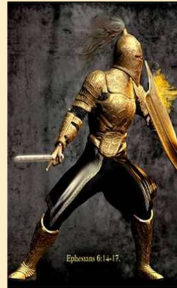
The armour of God Ephesians 6:14-17.