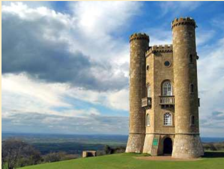
Our strong tower